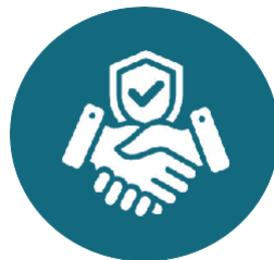
Secure Deal Registration