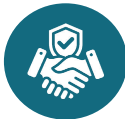
Secure Deal Registration